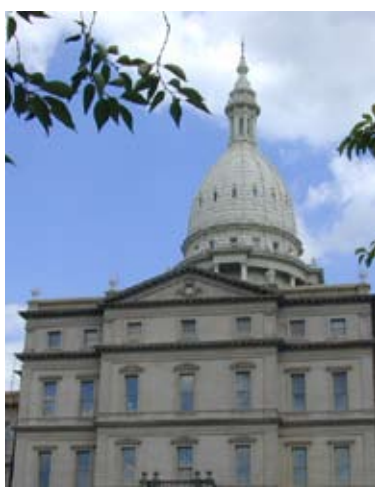
Out-of-town visitors, staying overnight in Lansing, may soon be paying a 2 percent room tax.

new state law would likely A new state law would have a further Michigan's status as having one of the nation's highest state and local tax burdens. House Bill 4261, now Public Act 25 of 2007, allows convention and tourism bureaus in Kent County and Lansing to levy a 2 percent hotel and motel rooms tax to support marketing and promotion programs. This would be on top of existing marketing levies. A referendum of lodging providers would be required if requested by least 40 percent of the owners of "transient facilities" subject to the tax.