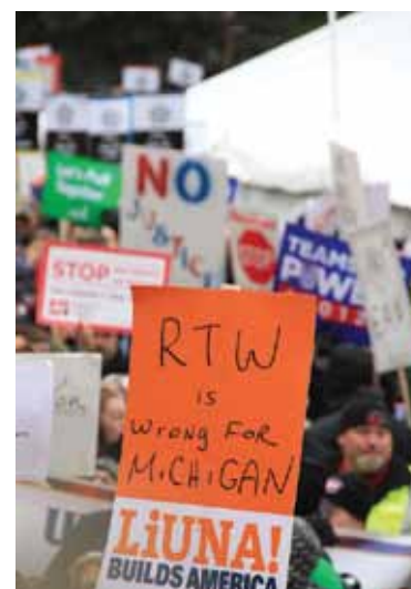
Union members protested at the Capitol in December 2012 against right-to-work.

discussion. I appreciate those who reached out to me from industry and businesses who are concerned about workplace productivity because of employee divisions.