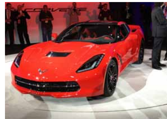
2014 Corvette Stingray

However, to a person, the executives I spoke with said that if the government's long-term fuel restrictions