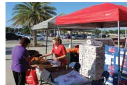
Patients grabbed a bag of donated fruits and vegetables on the way out.