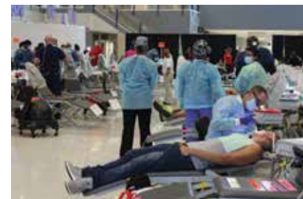
Volunteer dentists working on patients.