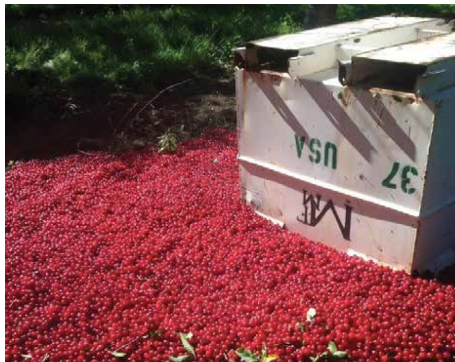
This photo, provided by Santucci Farm in Traverse City, went viral when posted on Facebook and created an outrage over why some cherries go to waste in Michigan.

The Cherry Board is made up of representatives of farmers and processors from seven states that are subject to the order. The representatives make industry decisions and send recommendations to the USDA, which then adopts or rejects the recommendations. In the 1990s, the marketing order was created by the USDA at the behest of the tart cherry industry. Every six years, the industry holds a