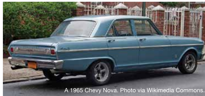
A 1965 Chevy Nova.