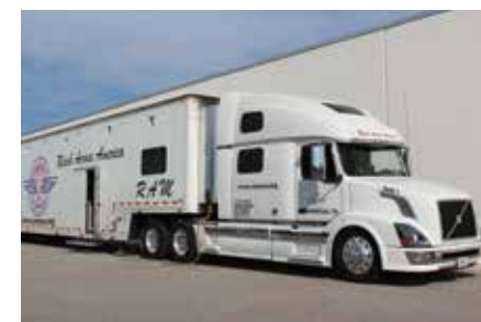
RAM clinics cost about $80,000 with most equipment trucked in.