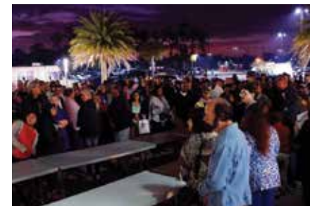
The clinic line outside before the doors opened.

Detroit is an area with many needs. The city has one of the lowest insurance rates