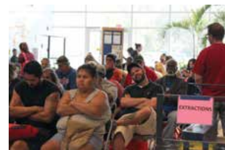
The waiting room.